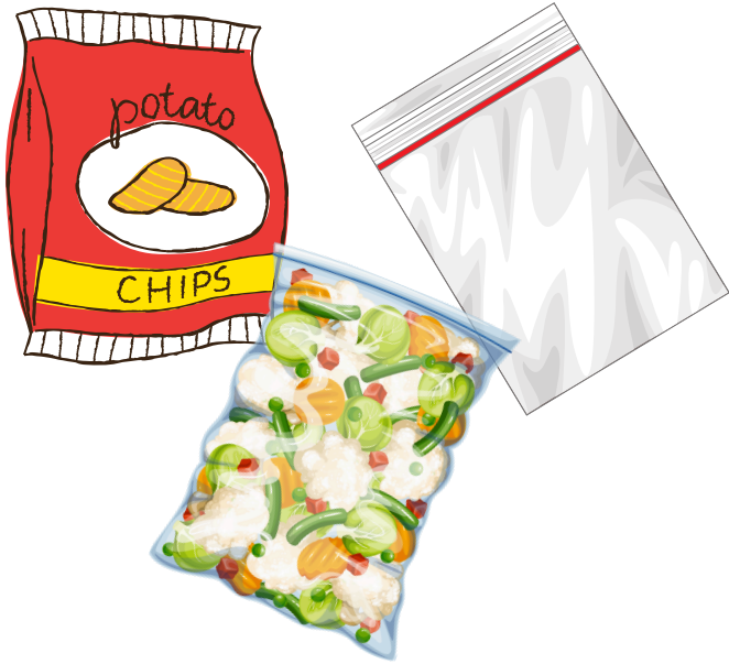
Kitchen & Pantry: wrappers, empty snack food bags, cracker/cereal box liners