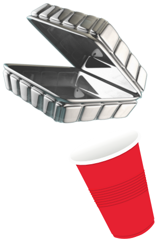
Dining: empty condiment containers, foam to go boxes, plastic cups, plastic plates + cutlery