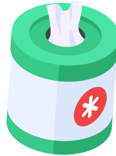
Storage & Cleaning: disposable cleaning cloths, plastic gloves, plastic grocery bags