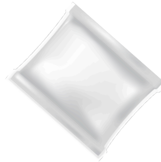
Office & Shipping: bubble wrap, foam peanuts, plastic air pillow packs