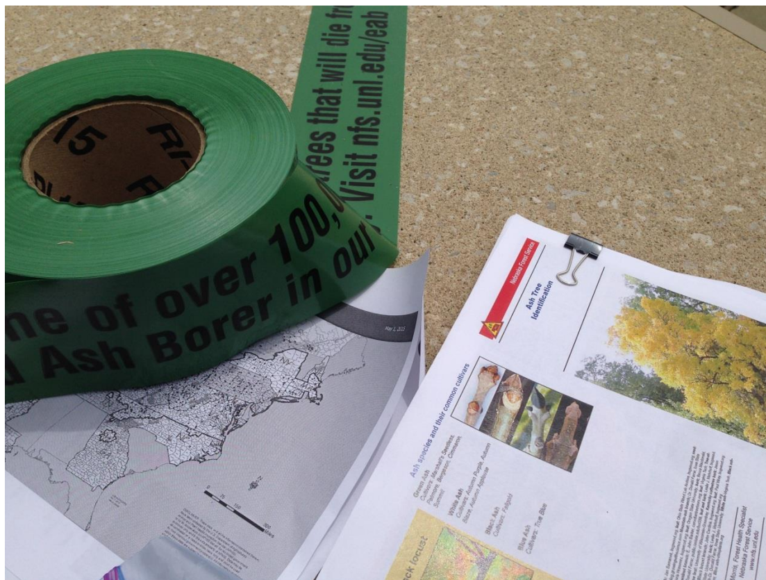
Some of the education materials used along with a roll of green Ash tree ribbon.

Two articles were also published in UNMC "Today" and Nebraska Medicine "NOW" to further educate the campus on EAB. The first provided information on EAB's discovery in Nebraska and the second on our response on campus , which included treating all applicable trees and the removal of 17.