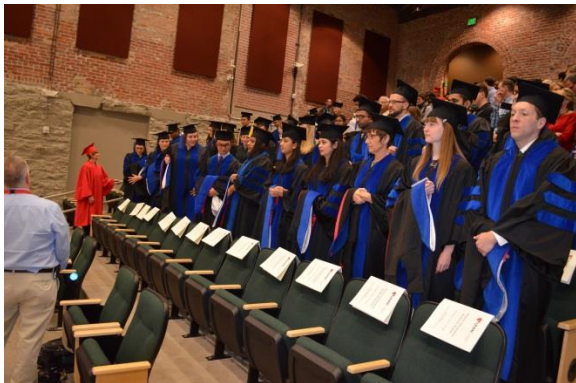
Graduate studies convocation 2015 2015