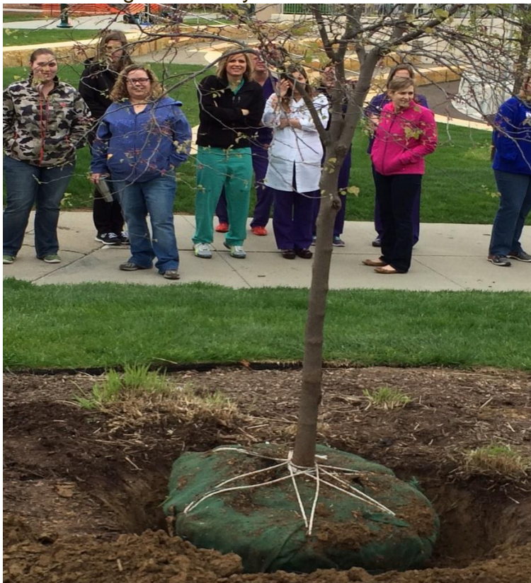
A chilly and blustery day for tree planting.

After the tree planting, participants could head inside to help City Sprout plant seeds before eating celebratory ice cream!