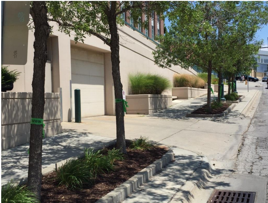
UNMC Students tie green EAB awareness ribbons around a small stand of Ash Trees in front of Bennett Hall.