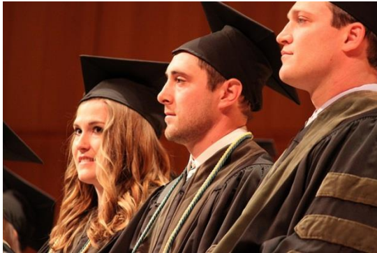
UNMC College of Pharmacy Graduation

There are 2,745 full time students at UNMC, making tree maintenance cost $17.23 per student.