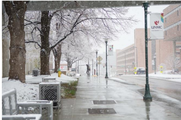
First snow of the winter Dec 9 th ,