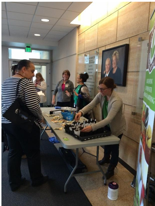
Planting seeds with City Sprouts